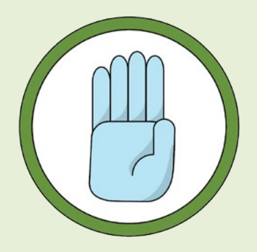
Take the MILITARY SAVES PLEDGE—a tool to help set savings goals.

When savers take the Military Saves Pledge they become part of a savings community to help motivate and support them as they achieve their savings goals. Service members and their families are encouraged to: