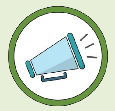
Receive educational and motivational communications to STAY ON TRACK with savings goals.