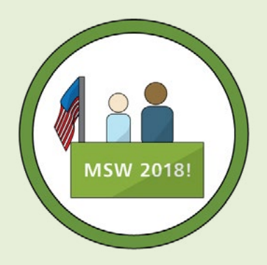
Participate in MILITARY SAVES WEEK—an annual opportunity to assess savings goals and take action.