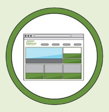
Read up on the latest in savings news from the MILITARY SAVES BLOG.