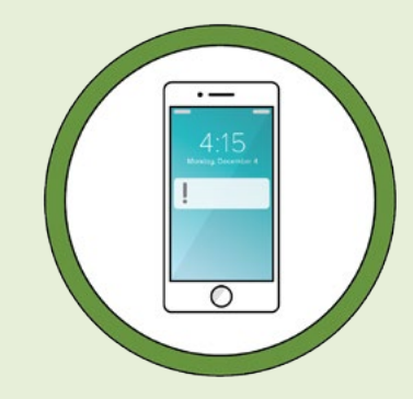
Opt-in to receive goal-specific text message TIPS & REMINDERS.