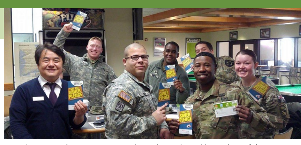
K-16 Air Base, South Korea: A Community Bank associate with members of the Better Opportunities for Single Soldiers organization after a meeting to discuss the importance of saving money and reducing debt.